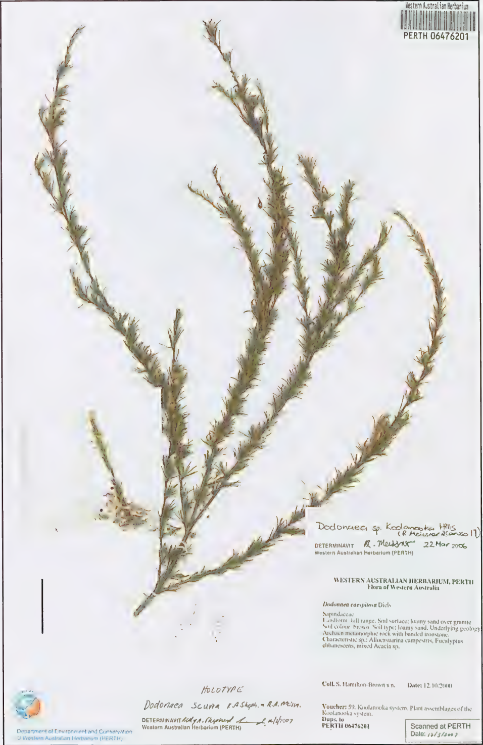
Figure 4. Holotype of Dodonaea scurra (PERTH 06476201). Scale = 3 cm.